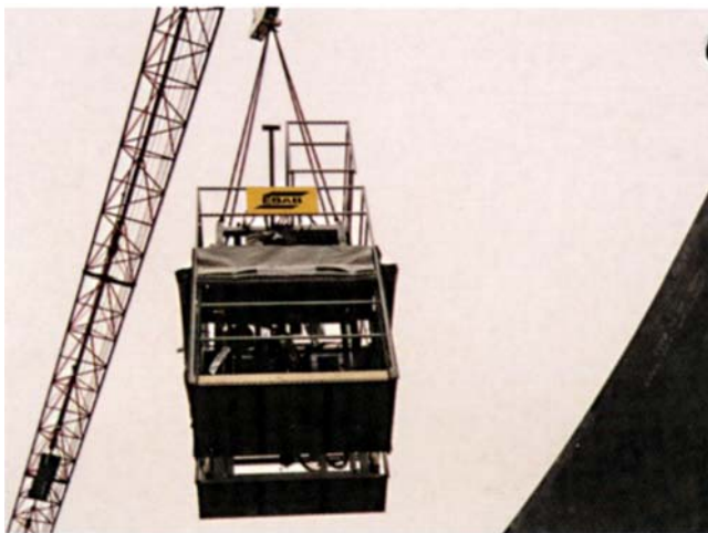
Double-side Circotech being lifted onto the job

The investment in a Circotech installation contributes to a consistent weld quality, which means low defect rate. The consumption of welding consumables is low because of efficient joint preparation. All in all this means good return on investment.